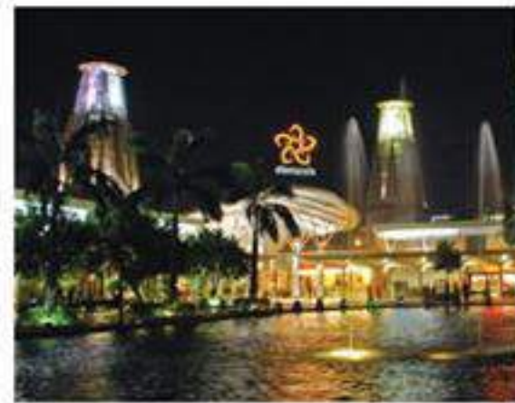
Alamanda Shopping Centre