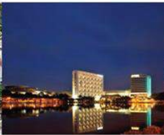
The Everly Putrajaya Hotel