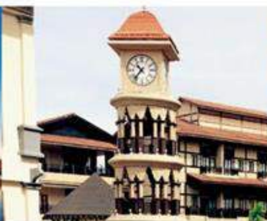
Pullman Putrajaya Lakeside Hotel