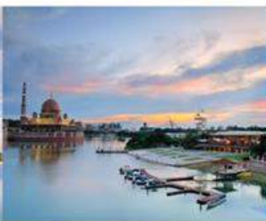
Putra Mosque & Putrajaya Lake Club