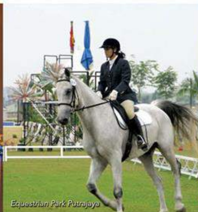
Equestrian Park Putrajaya