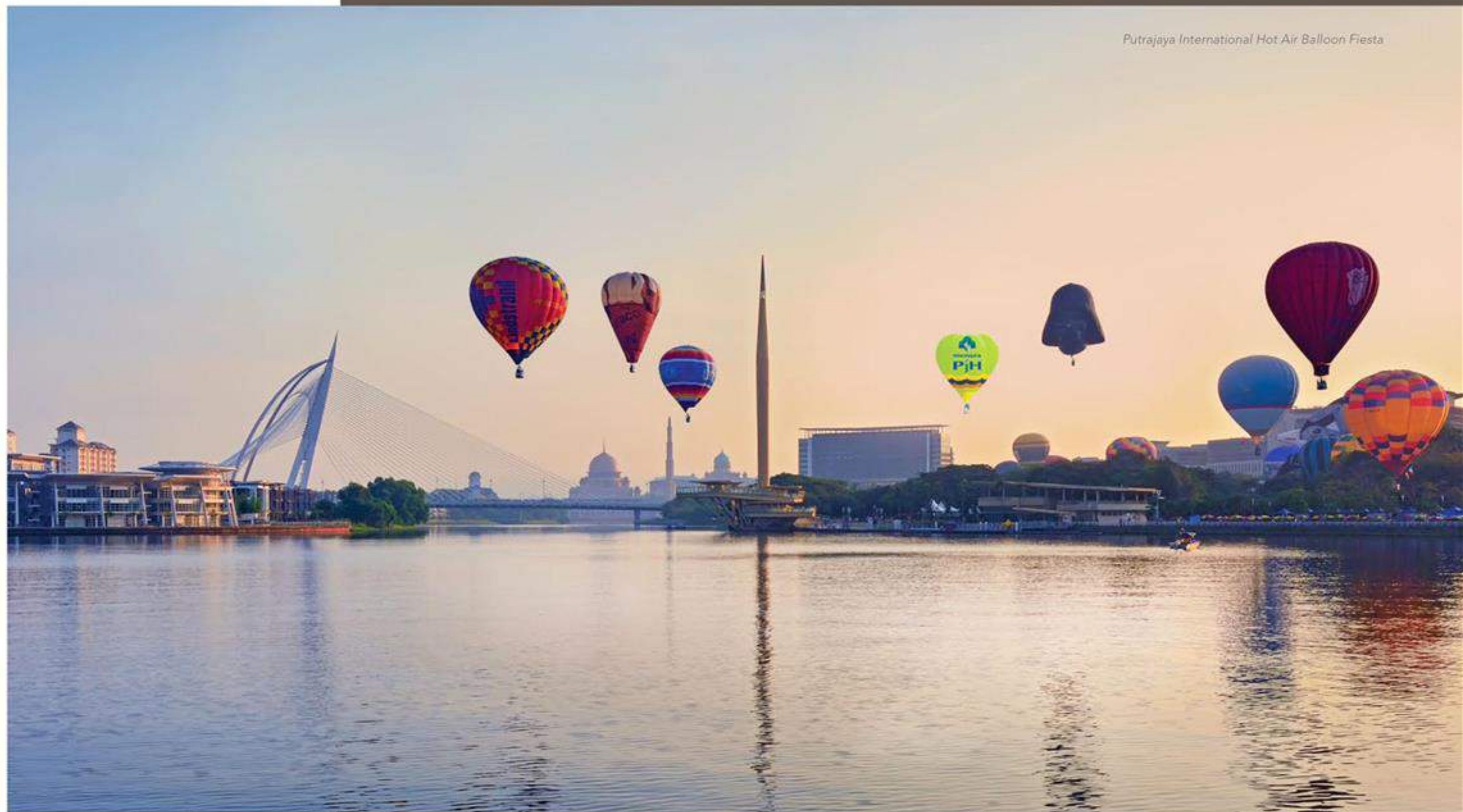
Putrajaya International Hot Air Balloon Fiesta

Putrajaya residents stand to take part in variety of recreations like sailing, windsurfing and horse riding here. Spectacular international events such as the Hot Air Balloon Fiesta, Red Bull Air Race, Dragon Boat Festival and Putrajaya International Fireworks Competition are perfect for families.