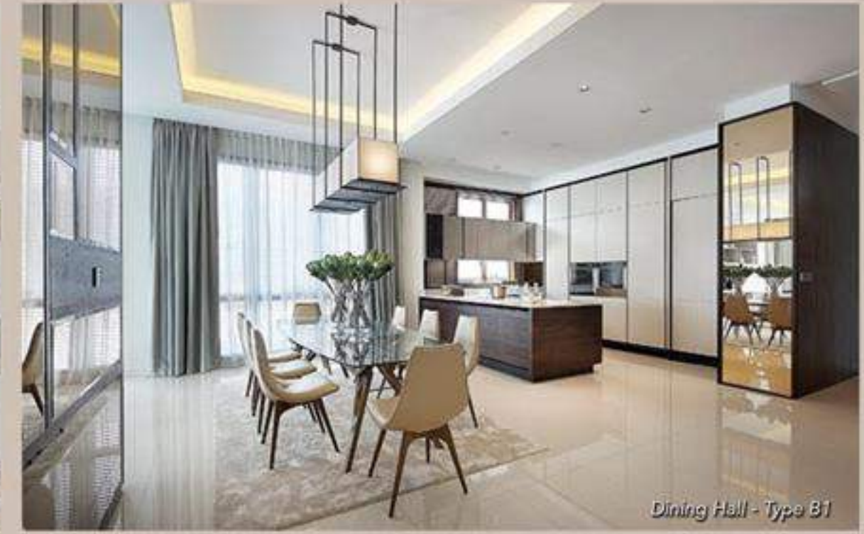
Dining Hall - Type B1