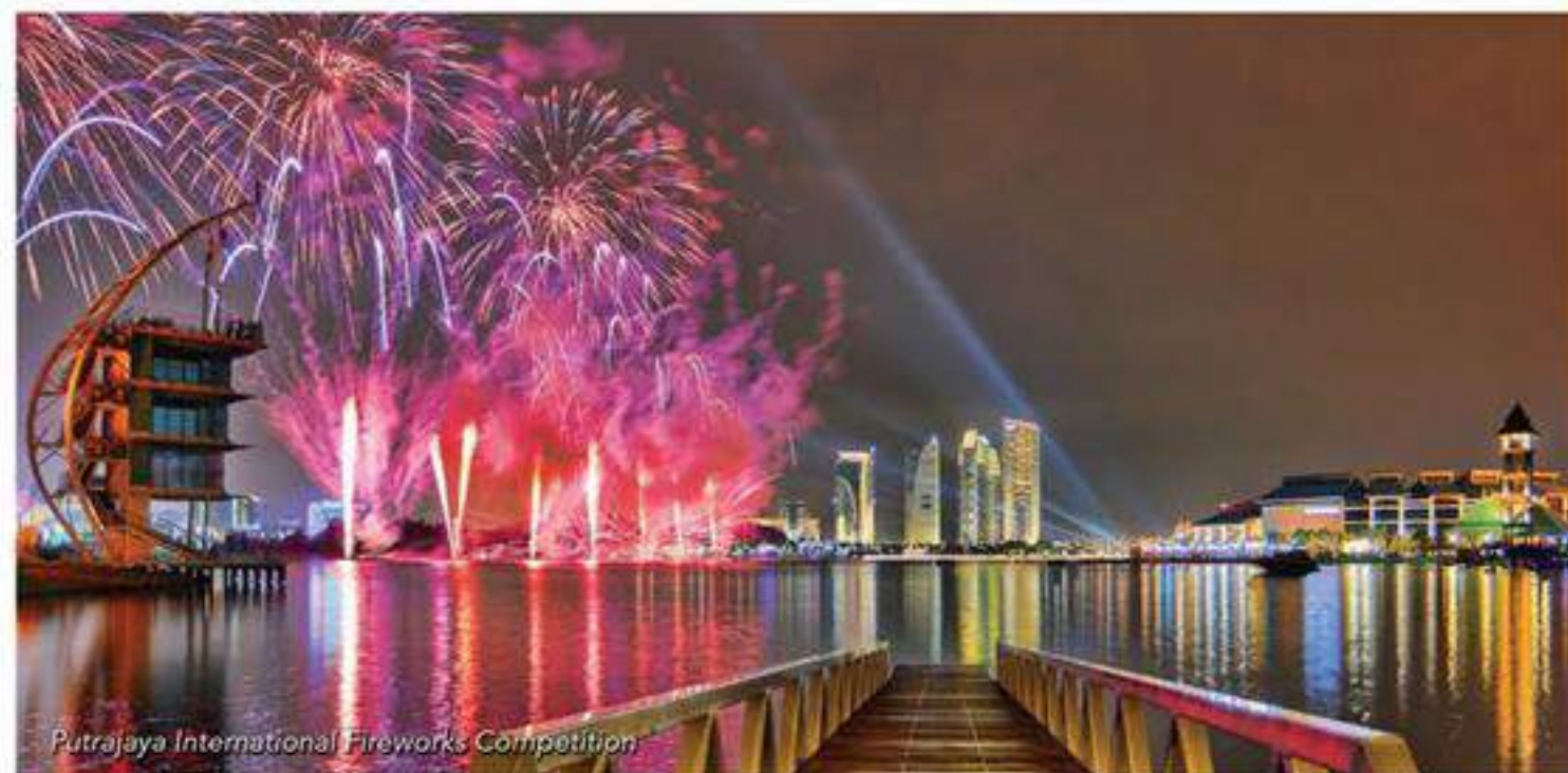
Putrajaya International Fireworks Competition