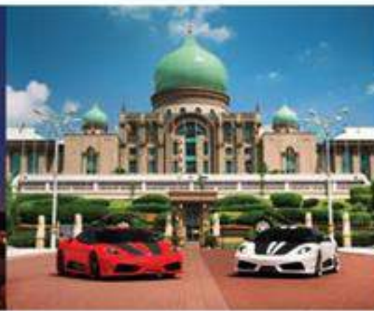
Prime Minister's Office