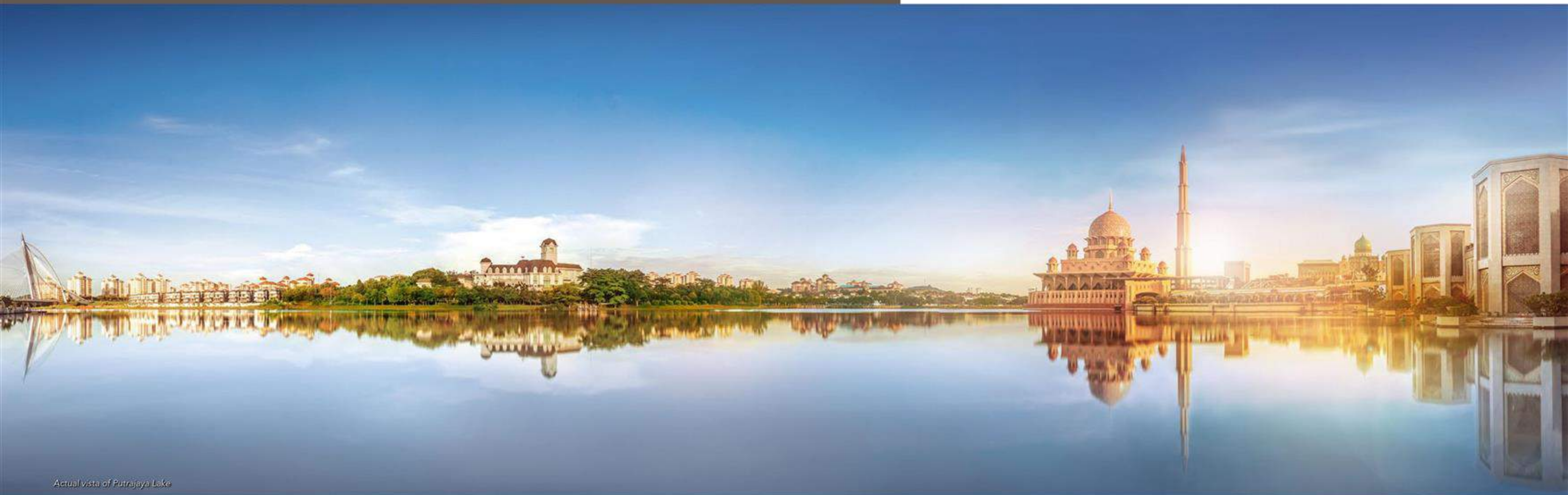
Actual vista of Putrajaya Lake