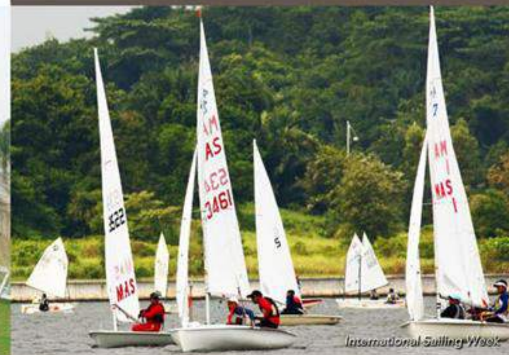
International Sailing Week