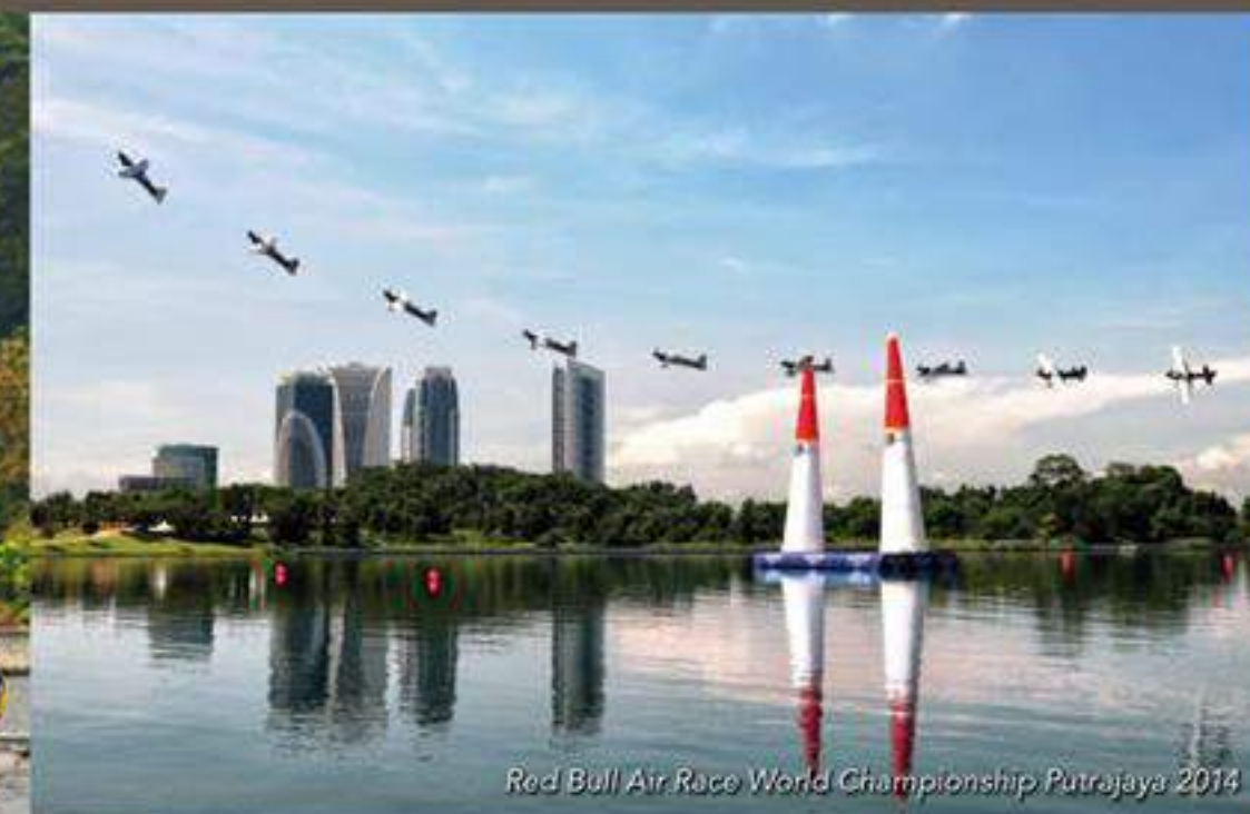
Red Bull Air Race World Championship Putrajaya 2014