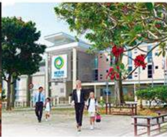
Nexus International School