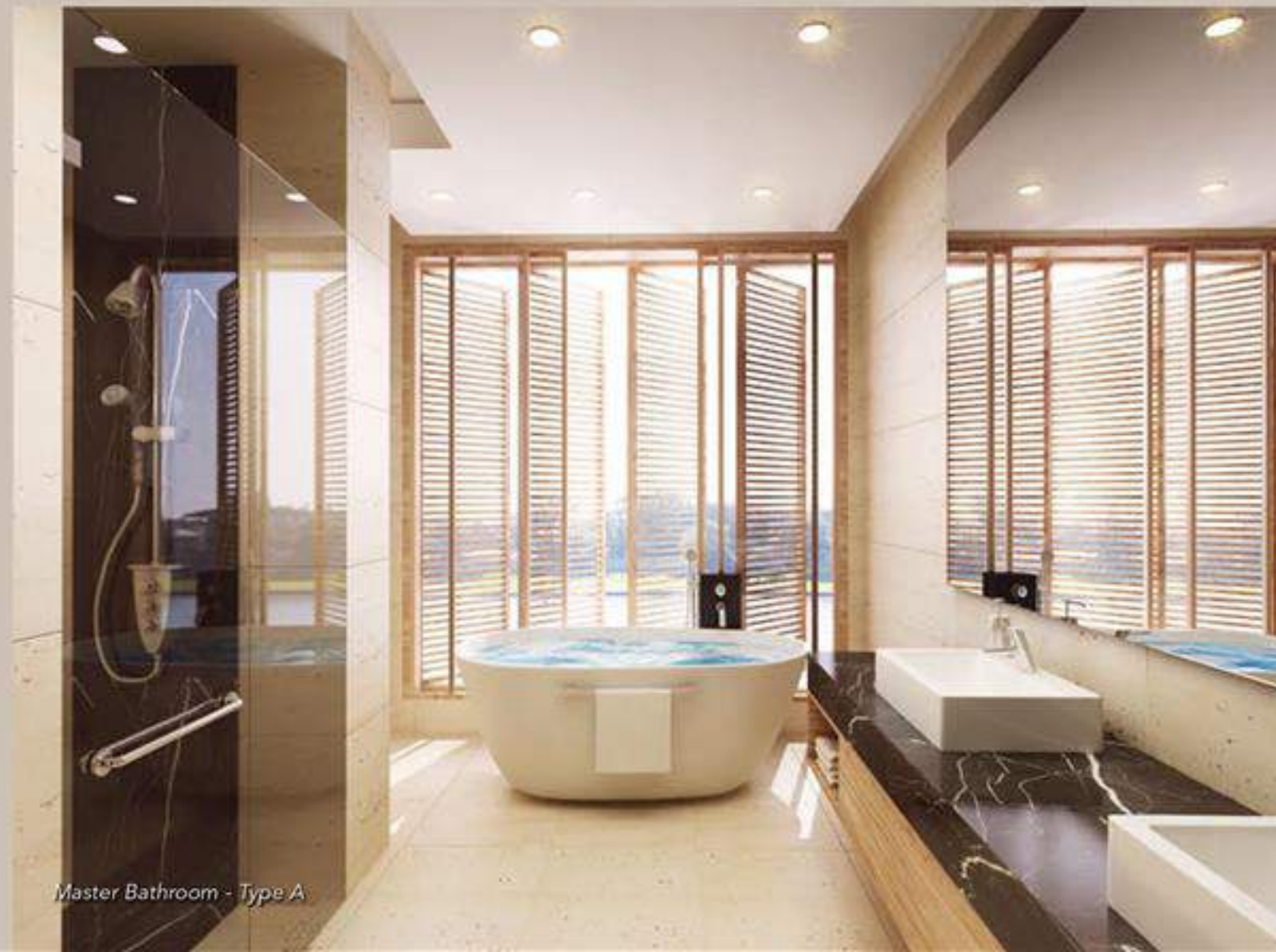
Master Bathroom - Type A