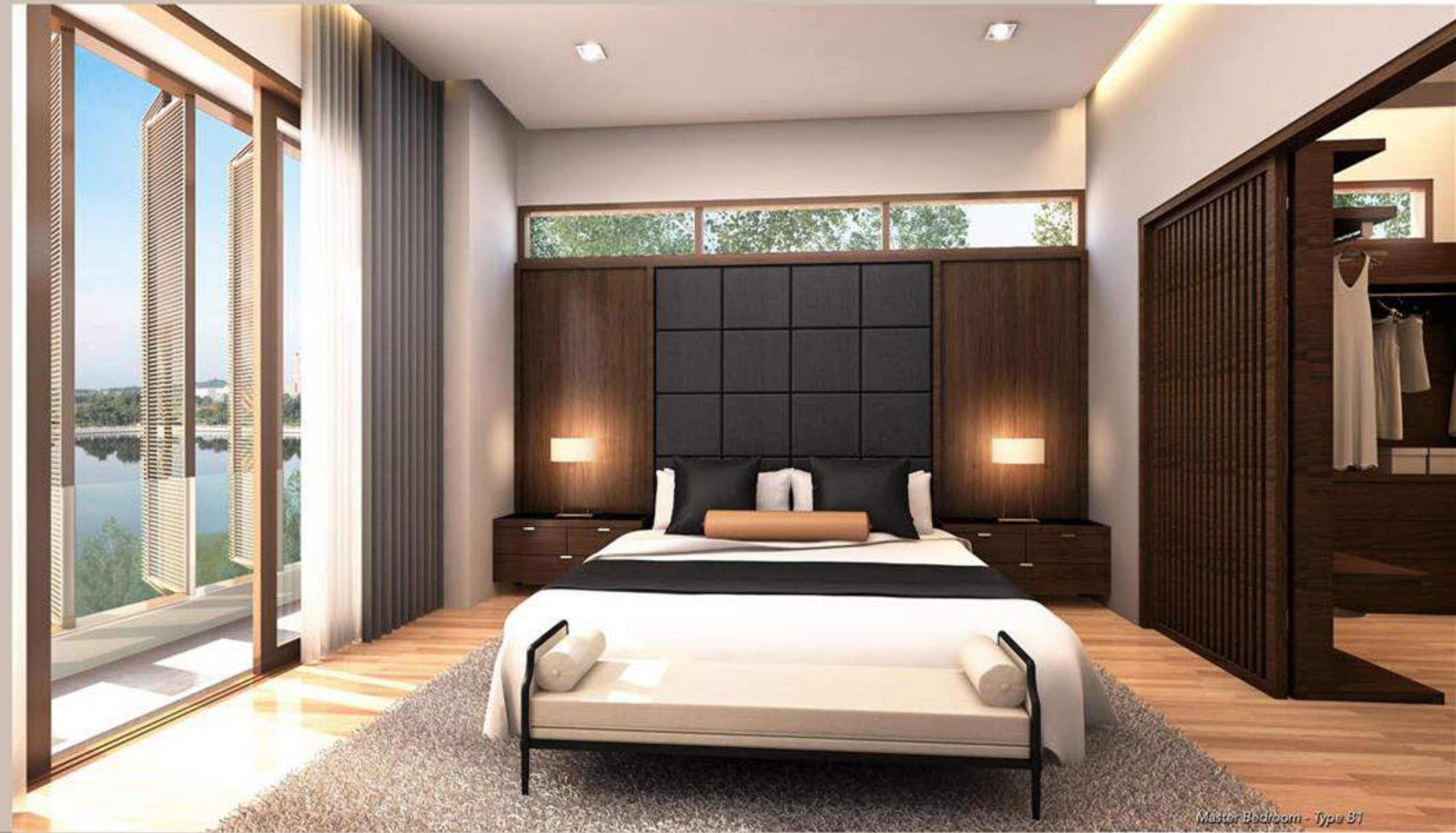
Master Bedroom - Type B1

The grand master bedroom, along with other comfortable bedrooms ensure lots of restful nights. Furthermore, luxurious ensuite bathrooms provide relaxation with a touch of class. Unwind and immerse yourself in the perfect experience.