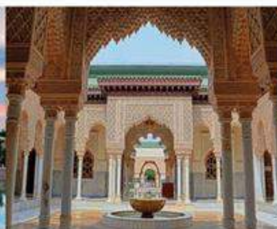
Moroccan Pavilion Putrajaya