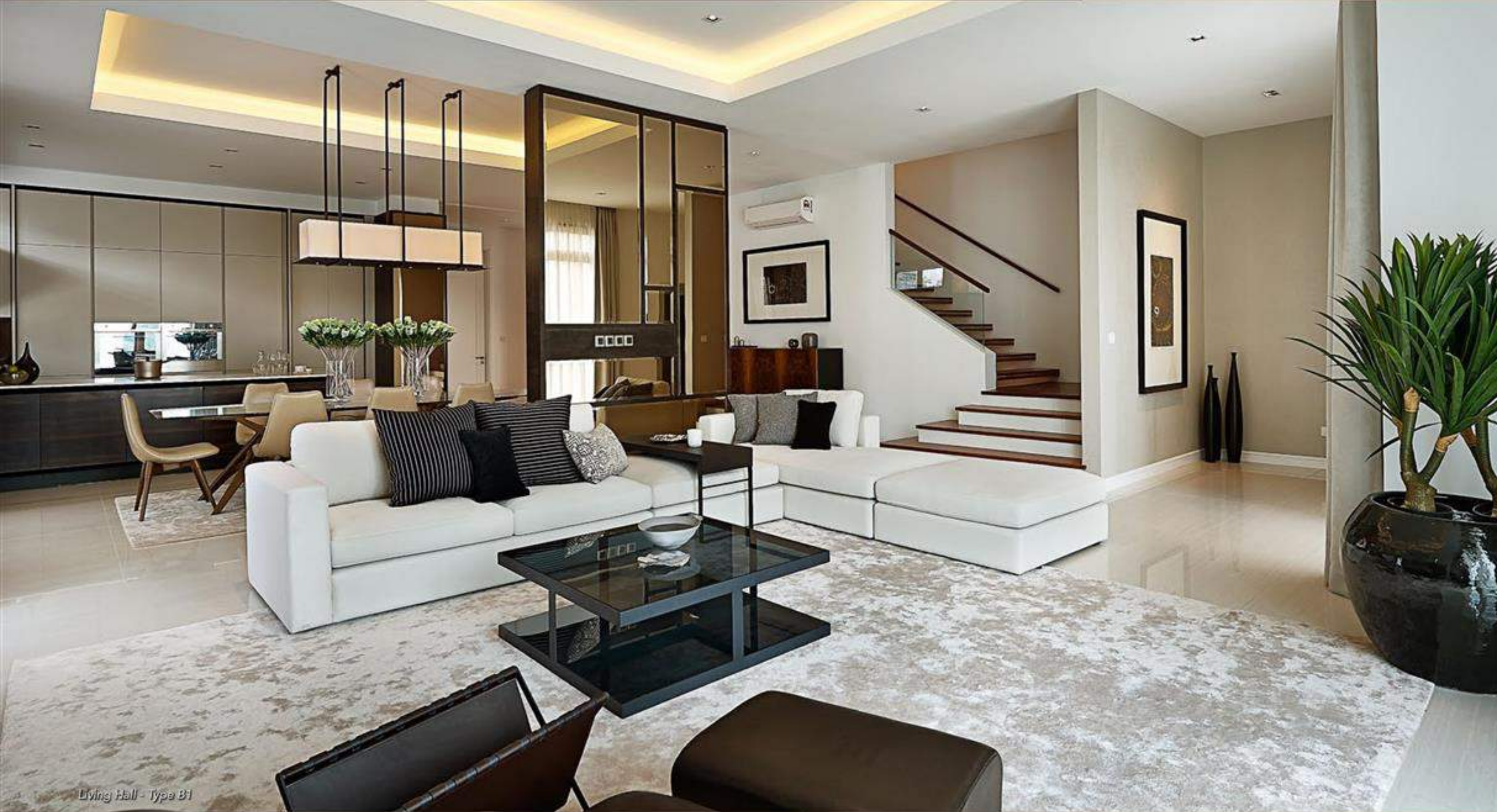
Living Hall - Type B1