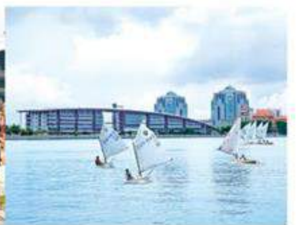
Heriot-Watt University Malaysia