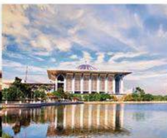
Masjid Tuanku Mizan Zainal Abidin